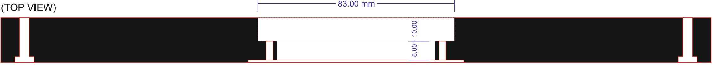
PART: Back MATERIAL: 18-20mm thick wood/ forex