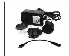
Power Adaptor (5V, 3A)

Quick Installation Guide (this document)