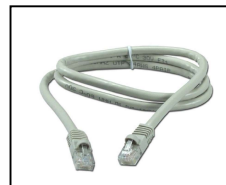
Ethernet Cable (RJ45)