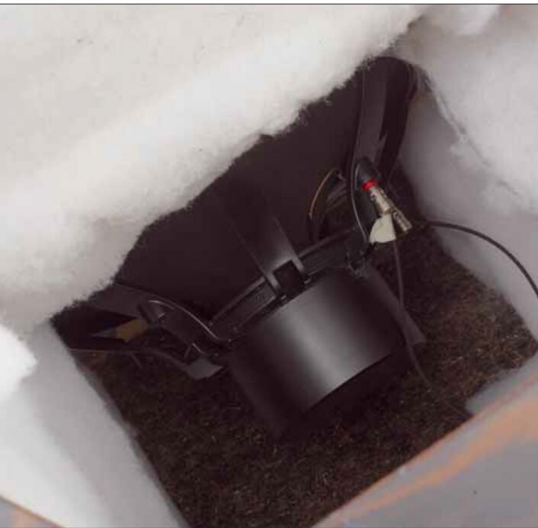
The bass can only be accessed through a flap in the floor. Note the powerful AlNiCo magnet