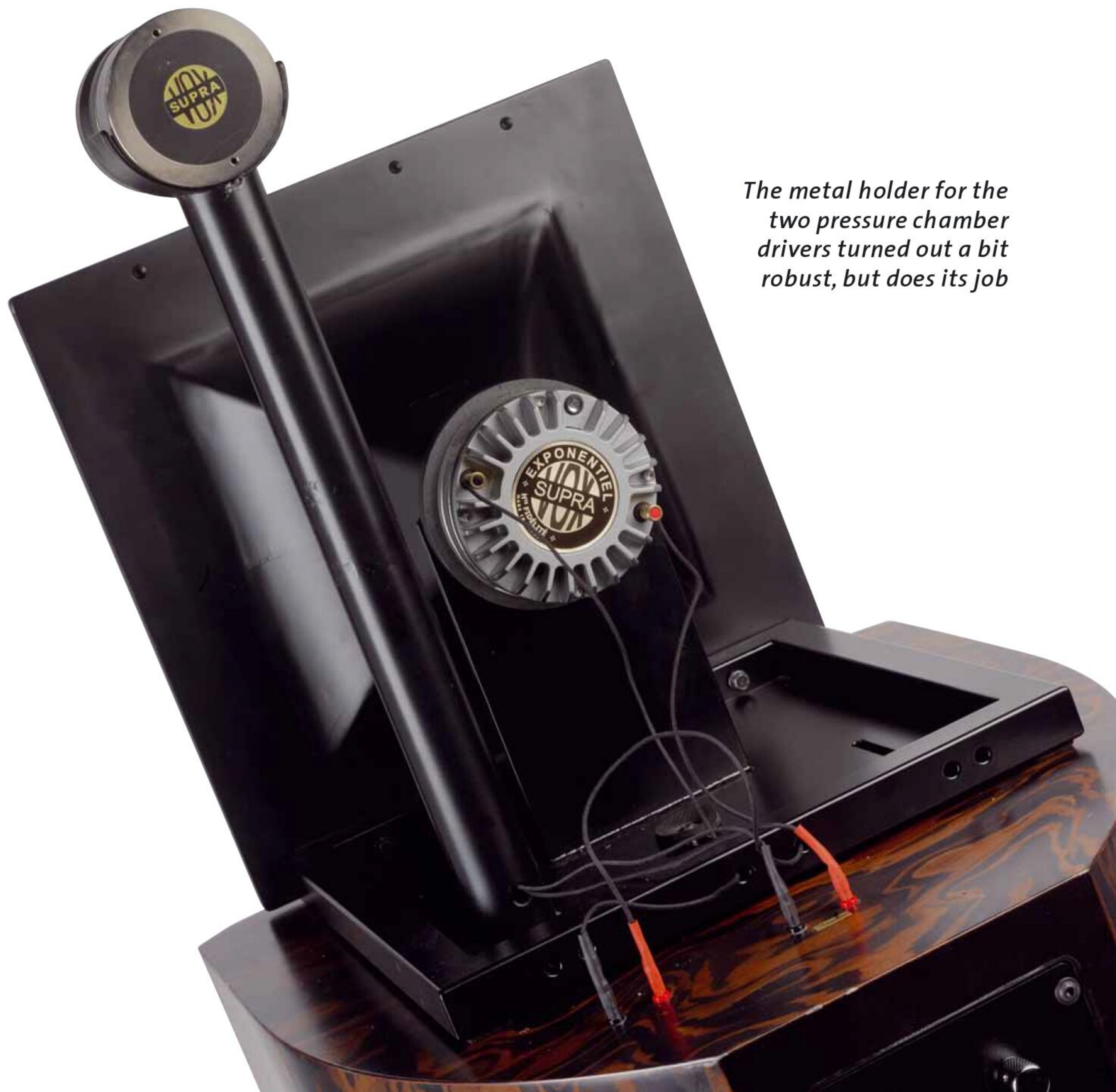
The metal holder for the two pressure chamber drivers turned out a bit robust, but does its job

With a width of over half a meter and a similar depth, the woofer cabinet is undoubtedly the most expansive component of the KL15 Heritage. The star of the show is the fifteen-inch driver, which is mounted from the inside in the old-fashioned way and has all the characteristics that we so sorely miss in modern woofers today: power-