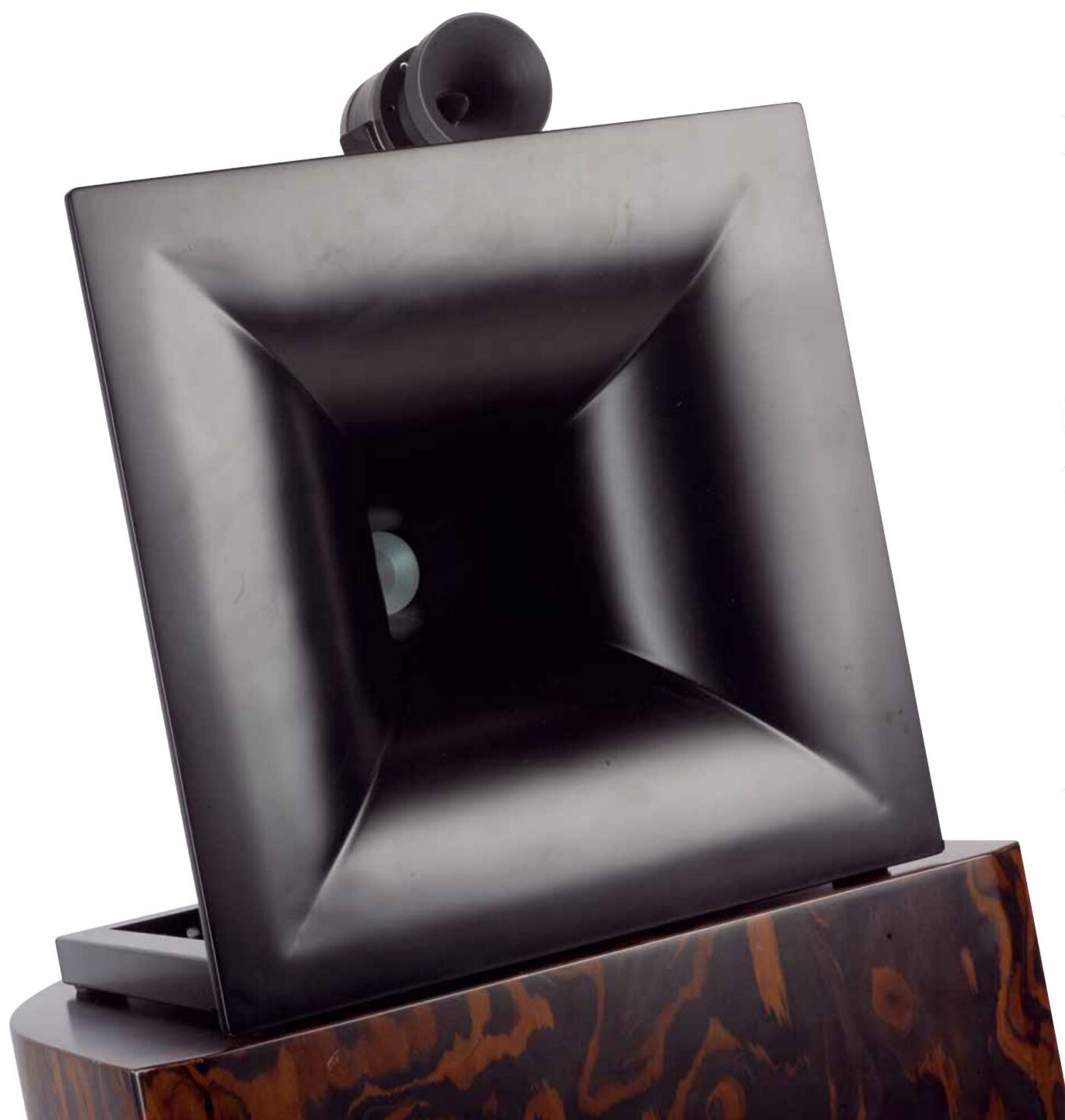
The cast horn based on the Klangfilm model is sound is an absolute dream

At around six kilohertz, the square horn transfers to a no less exotic ring radiator, for which Lamar Audio is also responsible. The 25 millimeter diameter diaphragm is driven by an impressive external AlNiCo magnet, which also ensures that the driver „sticks“ relatively securely in its somewhat robust-looking mount. The cone of the driver is made of good old phenolic resin, which JBL used „back then“ to create the