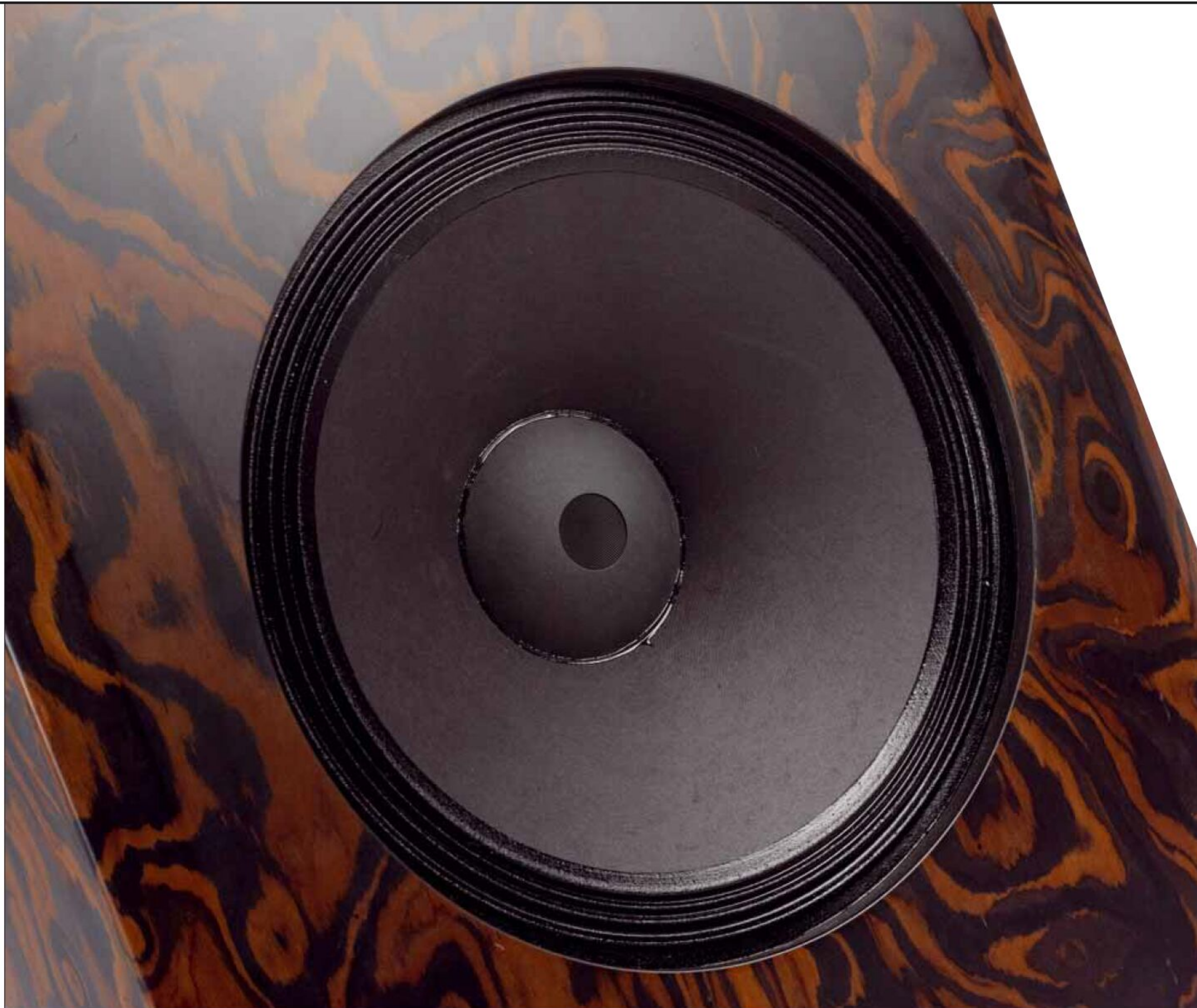
The woofer looks confusingly similar to a vintage type from Altec