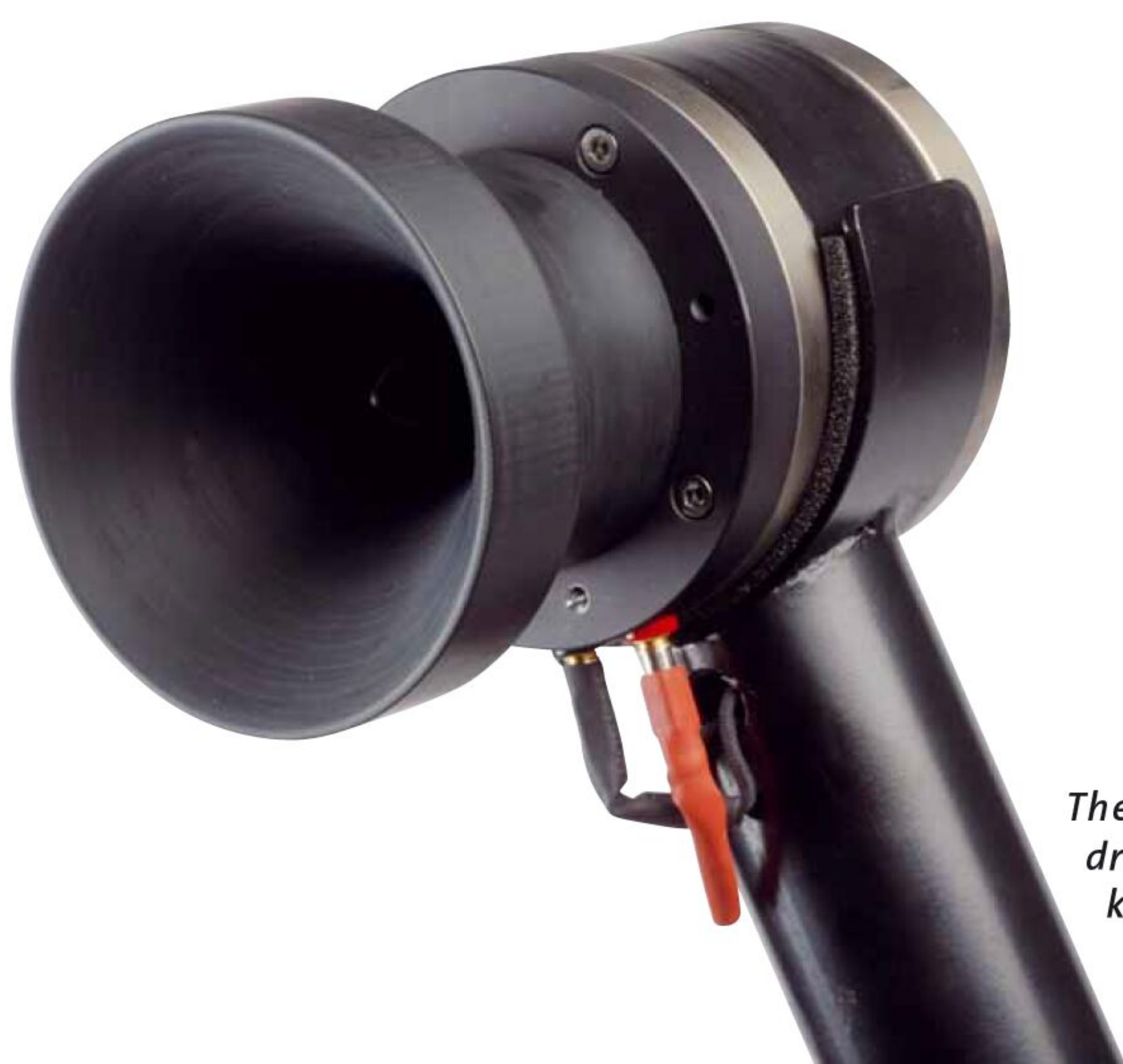
The small pressure chamber driver takes over from around 6.5 kilohertz the sound radiation