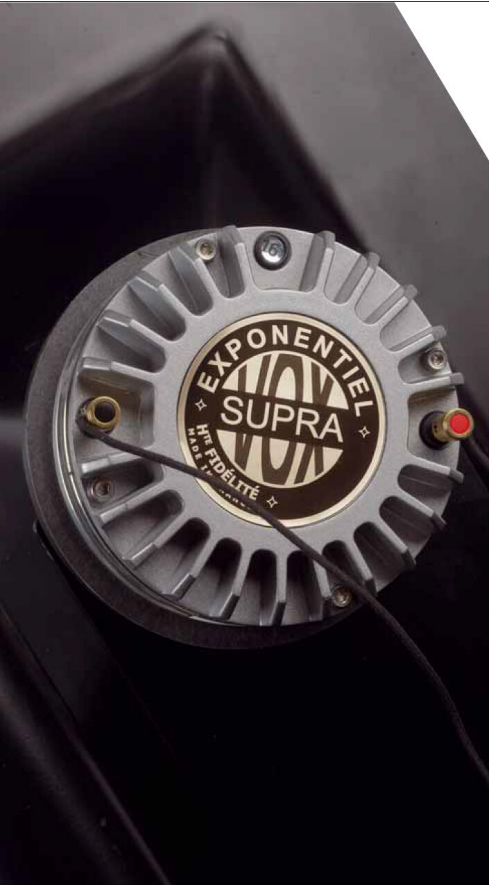
The mid-range driver is supplied by US specialist Radian

between the voice and the piano is exactly traceable. And even at extremely low levels, the imaging remains perfectly stable. The next striking feature is the tonal precision of the KL15 Heritage. The timbres are spot on, with not a trace of typical horn coloration. The transitions between the three branches are completely inconspicuous, which I consider to be perhaps the greatest design achievement in the conception of this loudspeaker. Sometimes you might get the impression that the sound is a little restrained at the very top. However, every gently struck cymbal, every brush on a drum convinces you otherwise: this part of the spectrum sounds super-fine and precise. The enthusiasm hardly wanes with Steely Dan’s „Gaucho“, on the contrary: the very first notes of „Babylon Sisters“ pamper you with a warm, profound but lightning-fast bass. If proof were needed that something like this is also possible with a bass reflex design - here it is. The opening choir vehemently tears an imaginary curtain away from the stage, the voices sound incredibly crisp and clean – this is how horns should sound.