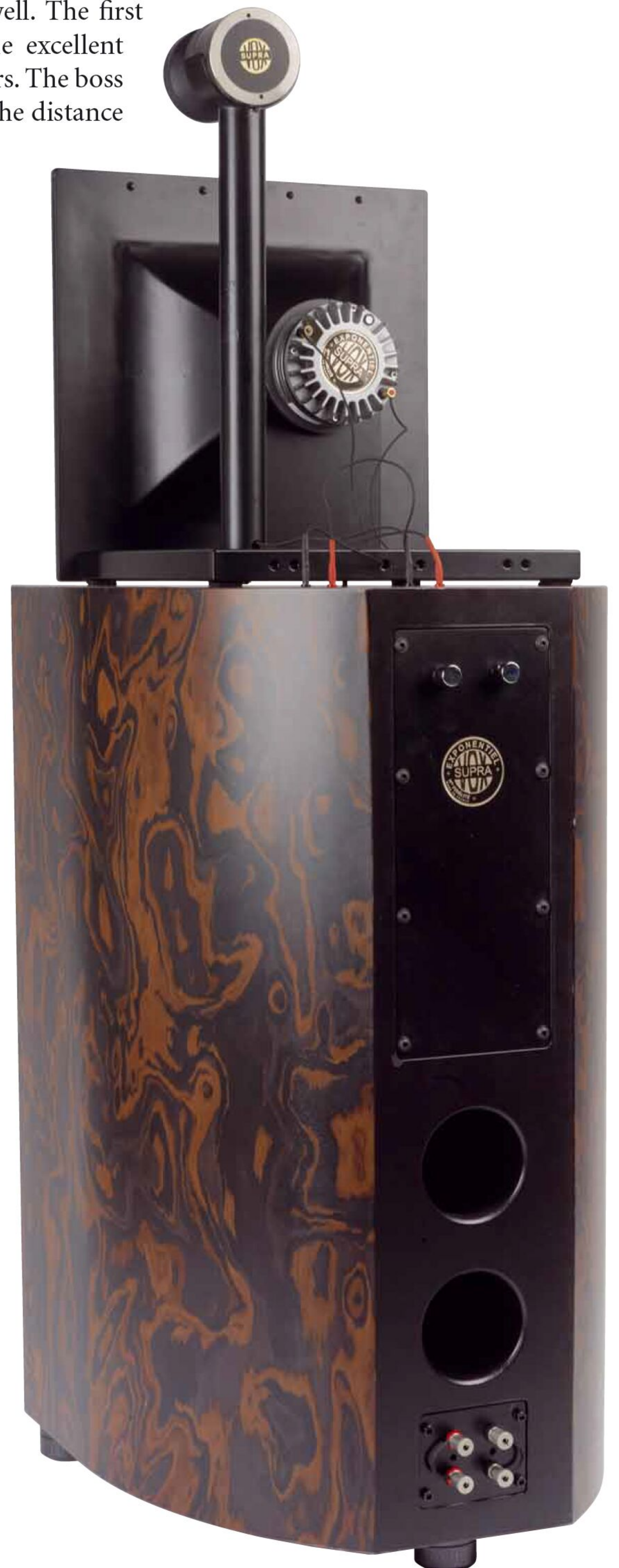
The two potentiometers at the top of the on the back allow a subtle level correction for the midrange and tweeter

turn of the indestructible Paul Kuhn and his trio to introduce me to his legendary late live recording „Live At Birdland“. Which worked shockingly well. The first thing that strikes you is the excellent imaging ability of the speakers. The boss sits perfectly in the middle, the distance