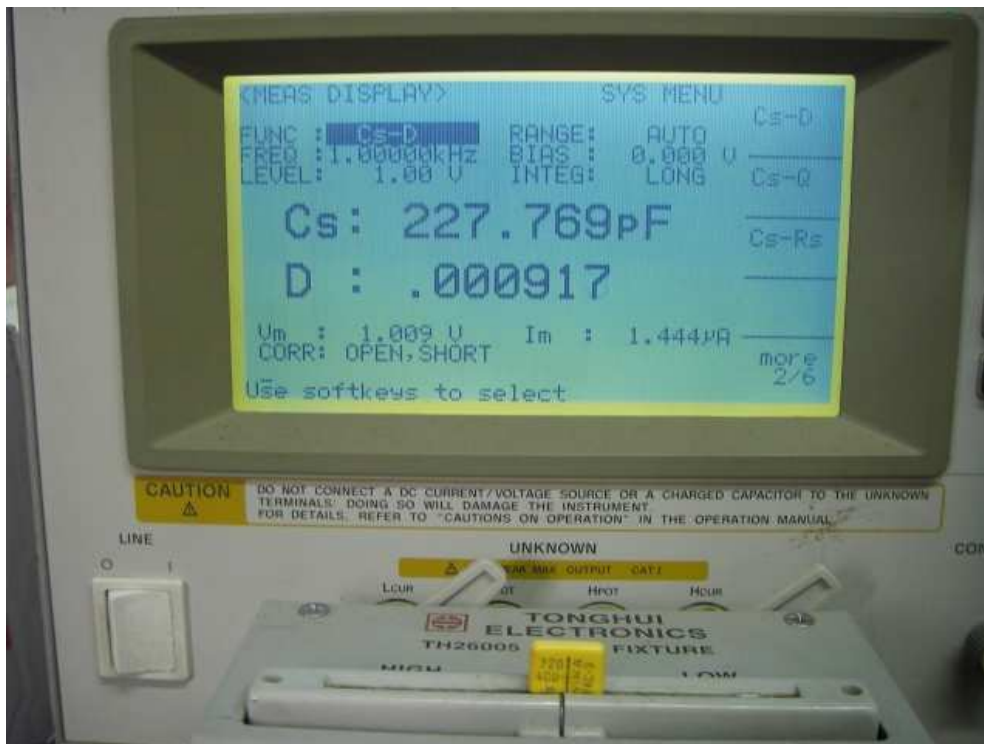
WIMA 220 pF, 10 %, 400 V, FKC-3