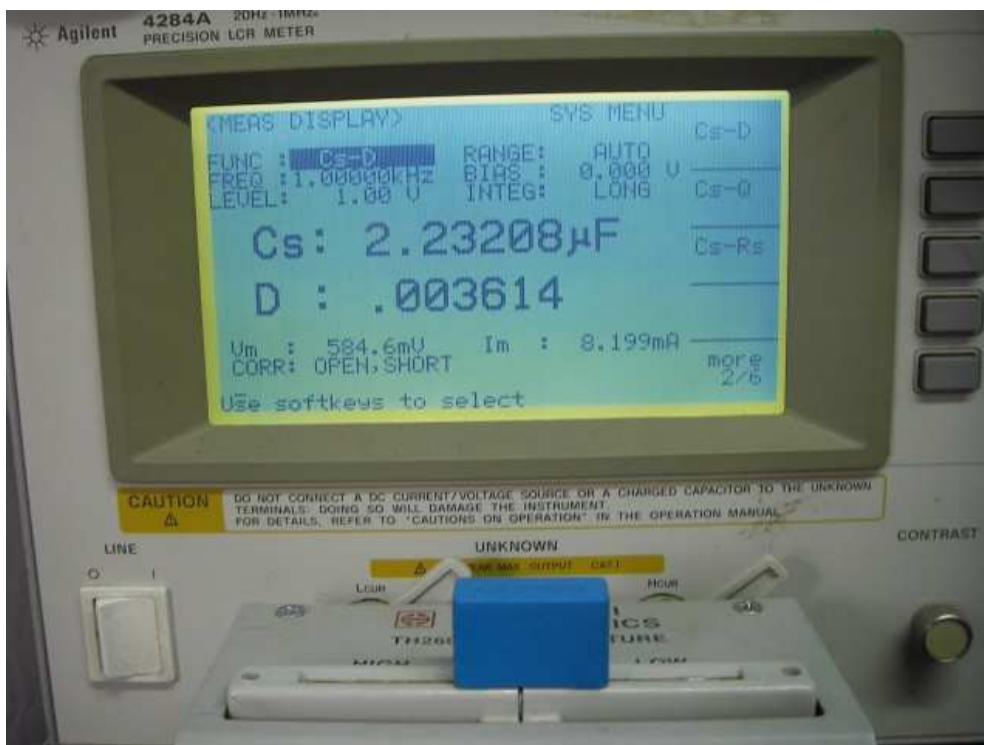
Siemens 2.2 \mu F, J, 250 V