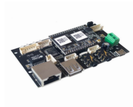
WiFi&Bluetooth HiFi Stereo Receiver Board