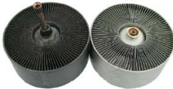
Figure 2. Improper cooling means short life. Discoloration of metal around the anode fins (left) indicates poor cooling or improper operation of the tube. A properly cooled and operated tube (right) shows no discoloration after many hours of use (note that some tarnishing of the plating may occur however).

be limited to 200°C at the lower anode seal under worst-case operating conditions. As tube element temperatures rise beyond 200°C, the release of contaminants locked in the materials used in manufacturing increase rapidly. These contaminants cause rapid depletion of the tungsten carbide layer