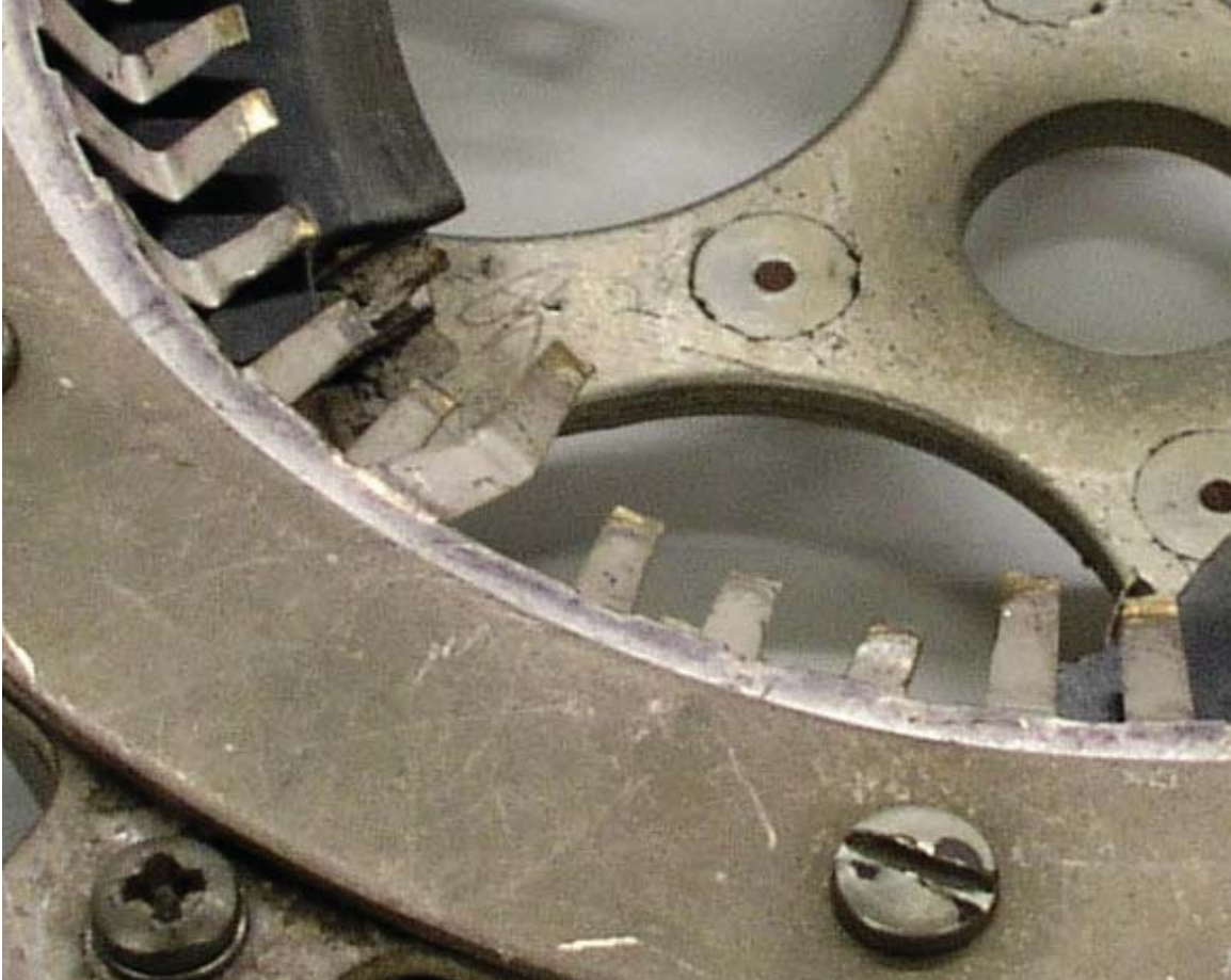
Figure 7. Bent and broken finger stock. Finger stock may become damaged due to effects of overheating or mishandling. Any broken finger stock must be repaired or replaced immediately to ensure long tube life.

Socket maintenance is an important part of regular transmitter system scheduling. Replacement parts are available for most Eimac sockets but having a spare socket on hand is the best advice for reducing down-time in case a failure occurs.