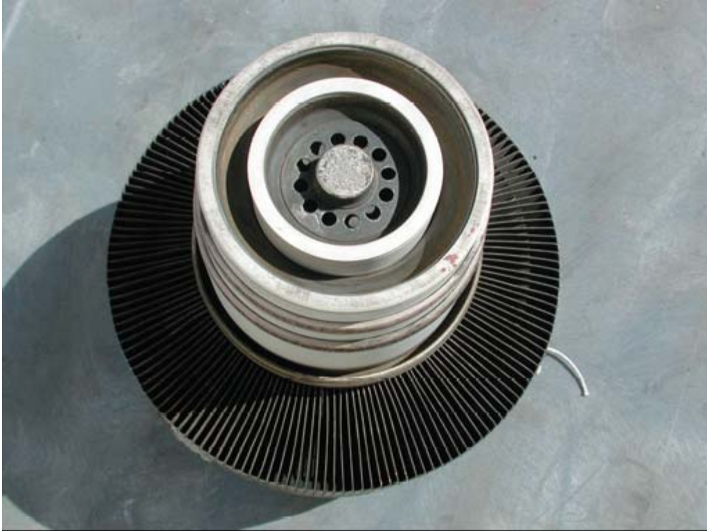
Figure 6 This tube appears to have been operated with low output efficiency (improper tuning or loading) or complete loss of air flow. Note the discolored stem and anode fins. This tube had a very short lifetime.

Eimac Application Bulletin No. 20, "Temperature Measurements of Eimac Power Tubes" describes methods for accurately determining operating temperatures on the base and anode cooler assemblies on power grid tubes. By using the techniques described in this paper, one can determine whether the cooling system in their equipment may be deficient or needs improvement. Occasionally something simple like air filters that have become plugged or a bearing failure in a blower may lead to overheated tubes. An exhaust air temperature measurement device will help spot abnormal temperature rise and prevent damage from overheating.