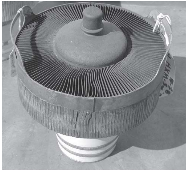
Figure 3 Example of a severely overheated tube. The cooling fins are discolored and badly distorted. This type of overheating will cause premature tube failure.