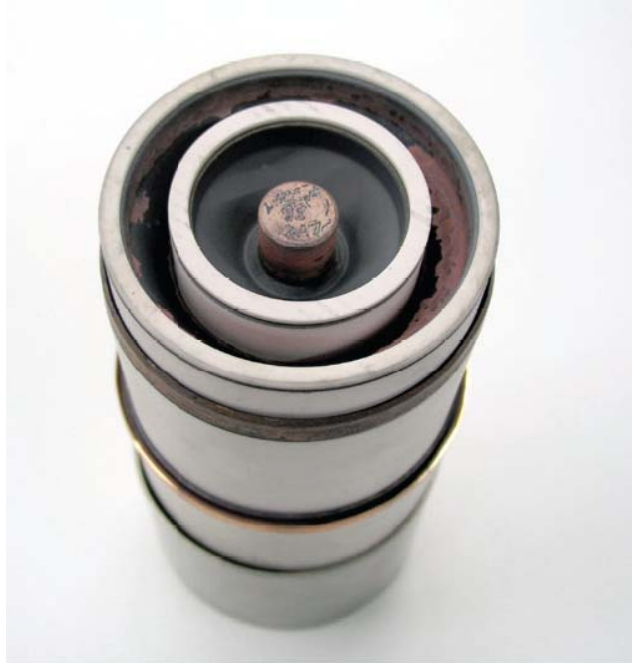
Figure 4 Water cooled tube with evidence of overheating. Note the severe discoloration in the tube stem. This tube will have a very short lifetime. Base cooling is of equal importance as anode cooling.