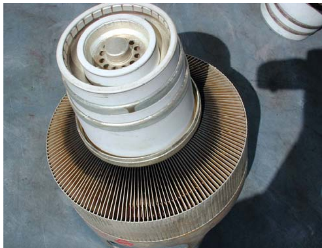
Figure 5 This tube shows evidence of being well mounted in a socket for at least a year (note the marks on the contact ring from the finger stock). However, there is no discoloration of the stem and the anode fins have some discoloration (air flow could have been improved somewhat on this tube).