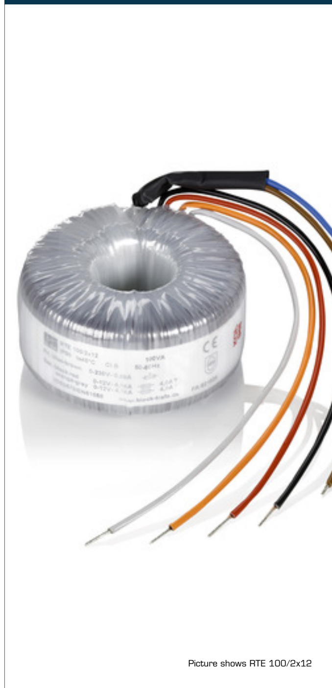
Picture shows RTE 100/2x12