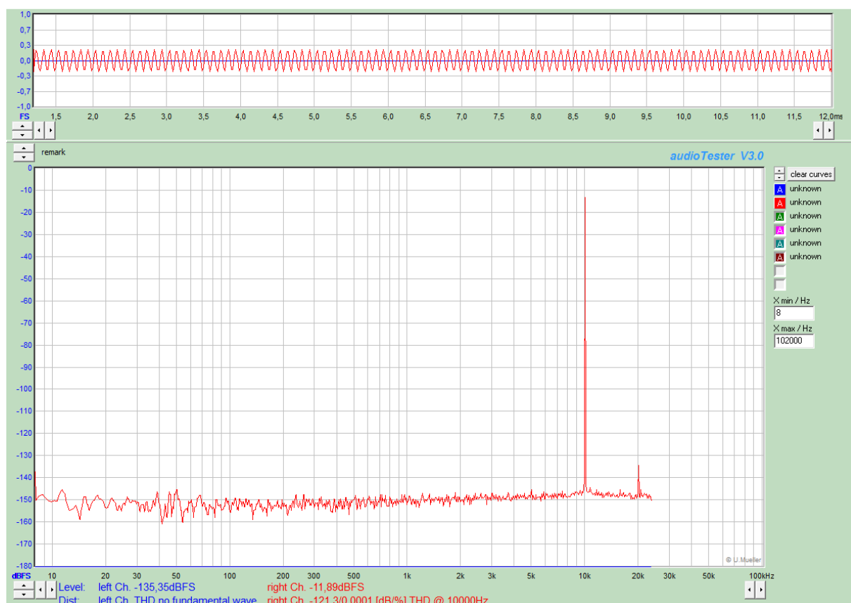
-10dBFS signal, AK4490 and AK5397 driven at 48 kHz. Input attenuator at -10dB.