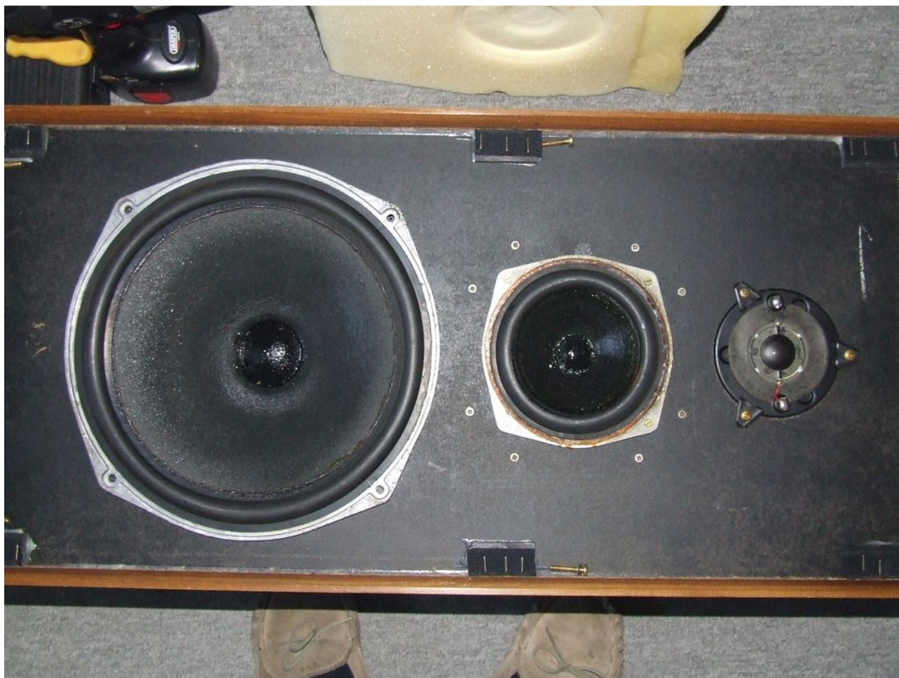
Ditton 44 – Speaker 2