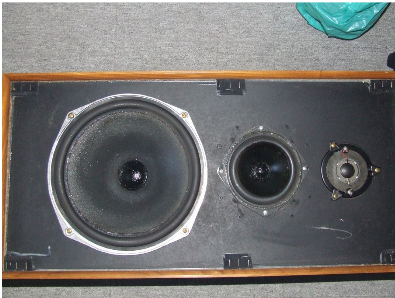
Ditton 44 – Speaker 1